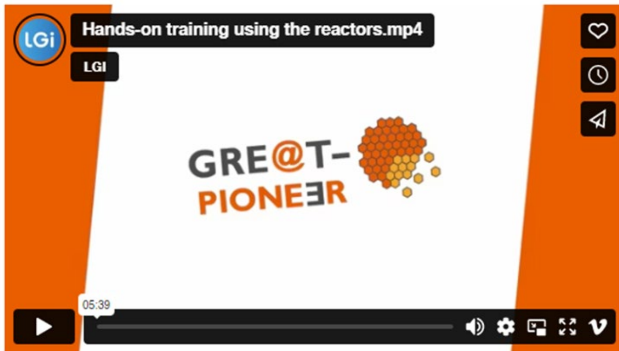
Figure 2. Snapshot of the advertising video used when the registration to the hands-on sessions on the training reactors open.