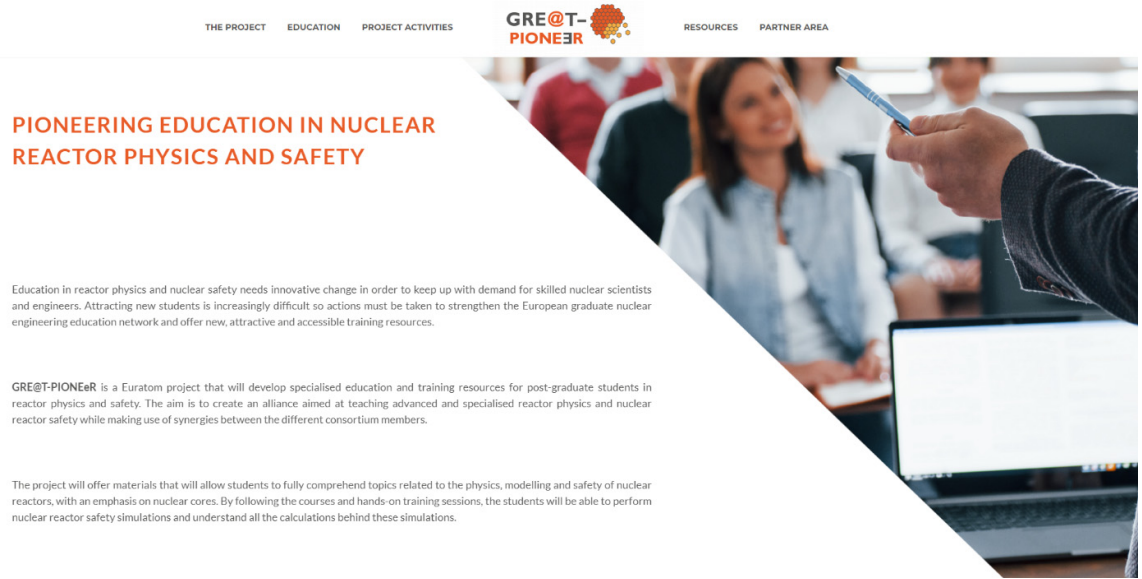
Fig 3. Frontpage of the GRE@T-PIONEeR website.

Maintaining the availability of competences in critical areas such as reactor physics, reactor modelling, experimental reactor physics, and nuclear safety, represents the main objective of the GRE@T-PIONEeR project. This is achieved by developing a set of courses building upon each other and by implementing innovative pedagogical approaches, the purpose of which is to maximise the efficacy of teaching/learning, to preserve knowledge, and to attract new students to the field. Beyond the ongoing development of teaching resources (handbooks, quizzes, videos, and hands-on training exercises), the consortium will soon focus on the implementation of active learning techniques fitting the purpose of the project and the technical content of the courses. The actual delivery of the courses is currently planned in late 2022/early 2023.