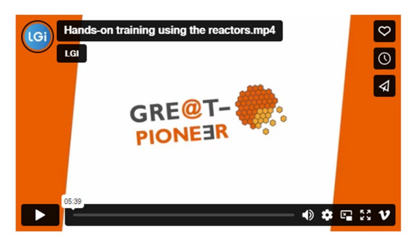
Figure 2. Snapshot of the advertising video used when the registration to the hands-on sessions on the training reactors open.