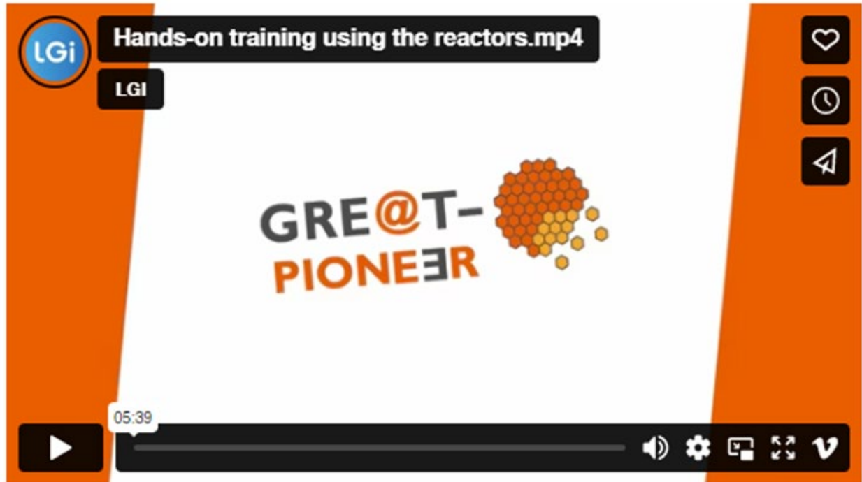
Figure 2. Snapshot of the advertising video used when the registration to the hands-on sessions on the training reactors open.